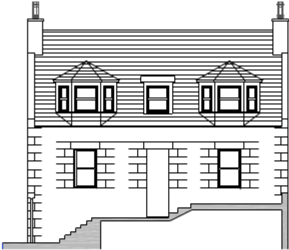
REAR ELEVATION - WEST PROPOSED