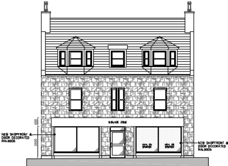
FRONT ELEVATION - EAST PROPOSED